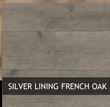
SILVER LINING FRENCH OAK