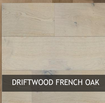
DRIFTWOOD FRENCH OAK