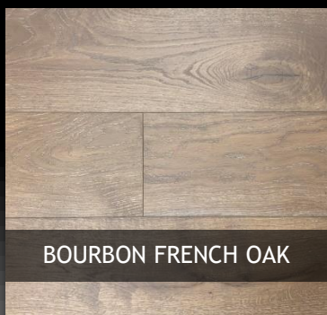
BOURBON FRENCH OAK