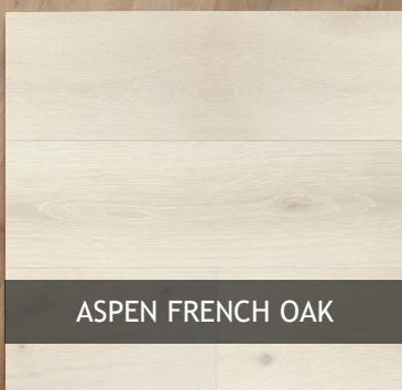
ASPEN FRENCH OAK