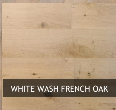
WHITE WASH FRENCH OAK