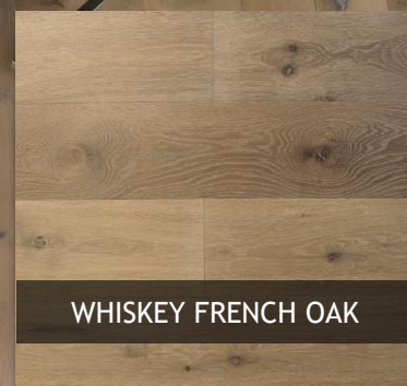
WHISKEY FRENCH OAK