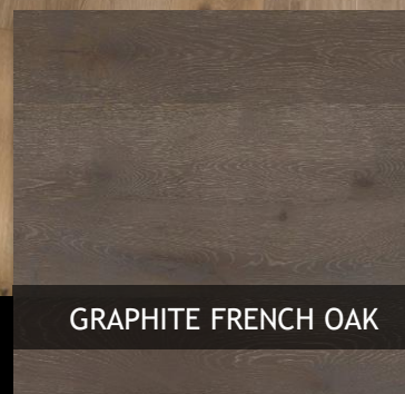
GRAPHITE FRENCH OAK