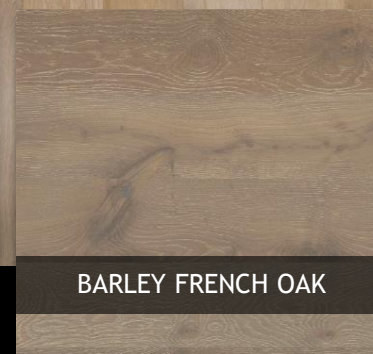
BARLEY FRENCH OAK