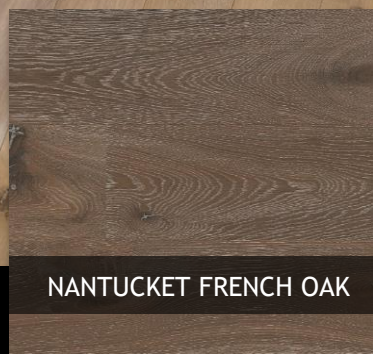
NANTUCKET FRENCH OAK